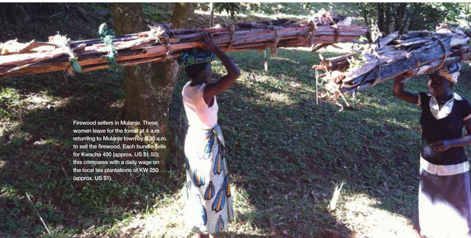
Firewood sellers in Mulanje. These women leave for the forest at 4 a.m. returning to Mulanje town by 8.30 a.m. to sell the firewood. Each bundle sells for Kwacha 400 (approx. US $1.50); this compares with a daily wage on the local tea plantations of KW 250 (approx. US $1).

Focus group discussions in Mulanje district indicated that women and men have very different expectations of a micro-hydro power community scheme that will provide electricity to the village. Women's expectations related to social and community issues while men's expectations related to greater opportunities for income generation. Understanding these different expectations is critical to the successful design and implementation of effective energy access solutions.