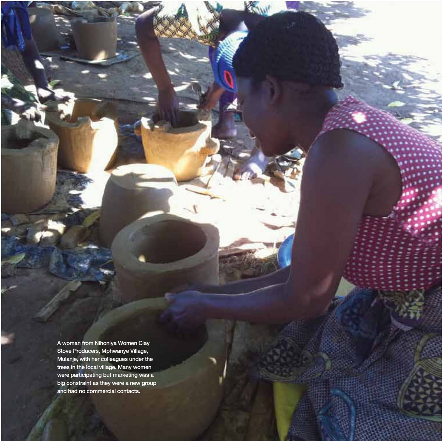
A woman from Nihoniya Women Clay Stove Producers, Mphwanye Village, Mulanje, with her colleagues under the trees in the local village. Many women were participating but marketing was a big constraint as they were a new group and had no commercial contacts.